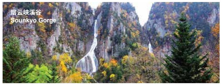
层云峡溪谷 Souunkyo Gorge